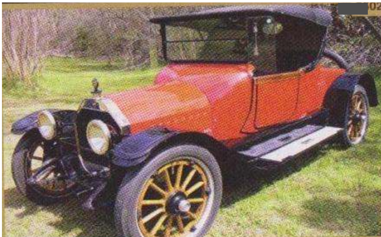
Obscure Car from last issue: Penn Lenson was the only person to correctly identify this car as a 1915 Oldsmobile. See page 5 for a new mystery car.